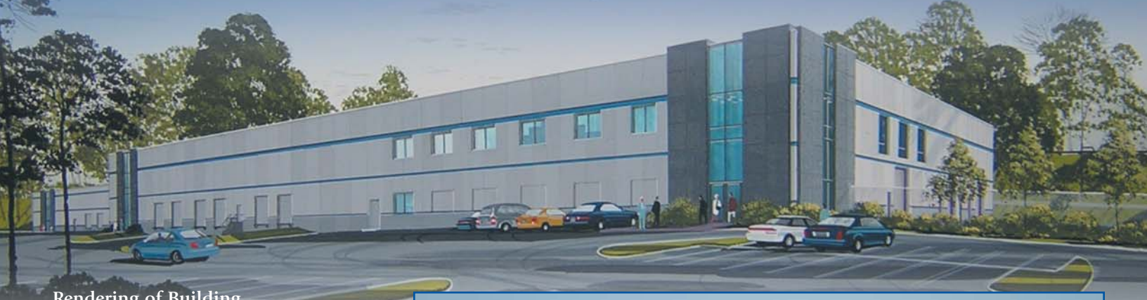
Rendering of Building

Industrial Units for Sale from 15,000 sq. ft. to 42,500 sq. ft.